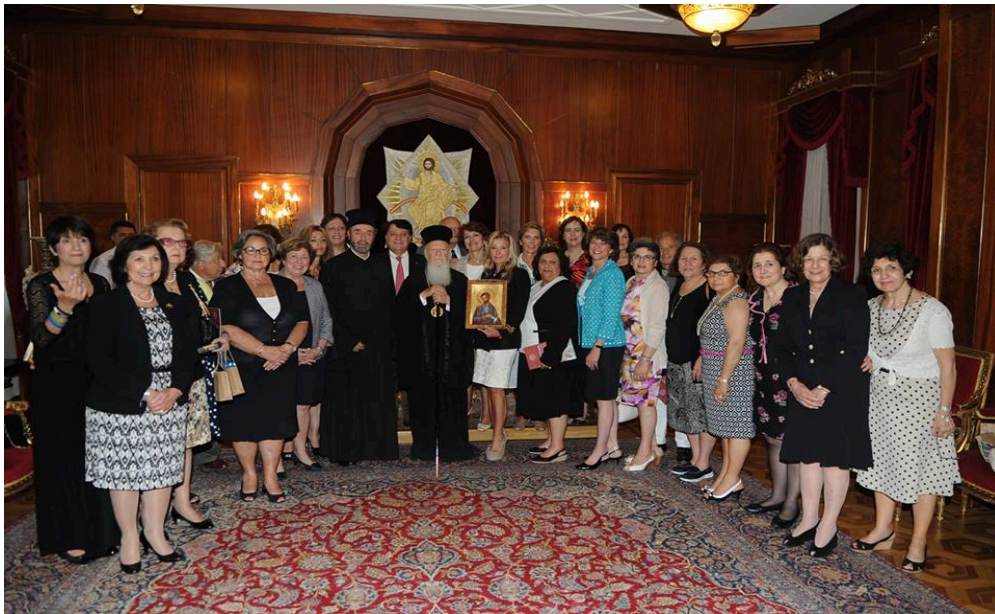
Pilgrimage Participants in the Patriarchal Throne Room where we experienced a beautiful audience with His All Holiness.