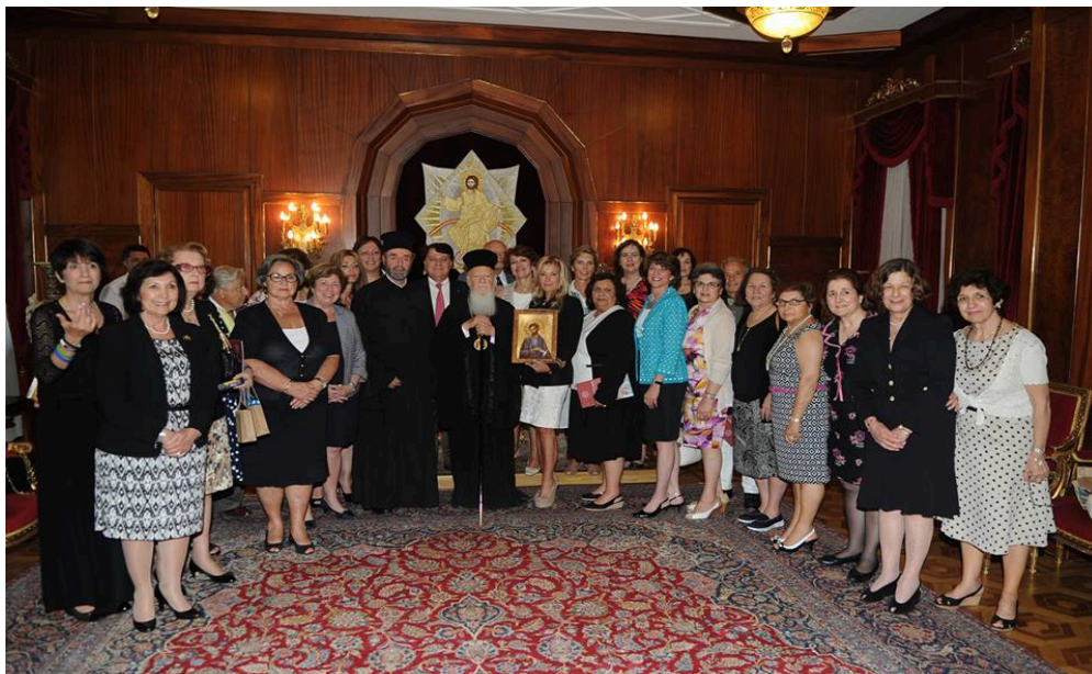
Pilgrimage Participants in the Patriarchal Throne Room where we experienced a beautiful audience with His All Holiness.