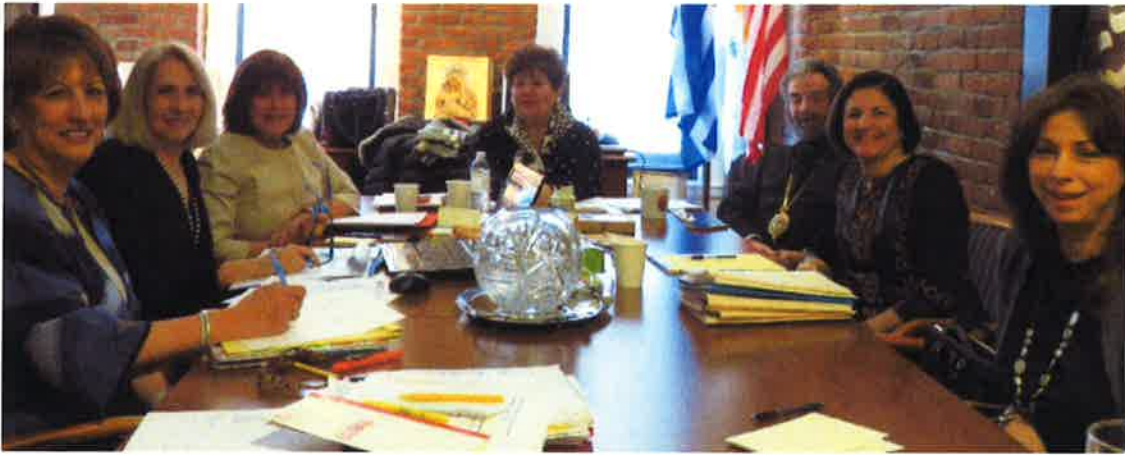
2016 National Philoptochos Convention meeting in the Philoptochos Center of Philanthropy on March 29, 2016

Strike a beautiful chord with us in Music City. Brush off your cowboy boots and come join us in Nashville, Tennessee from July 3- 8. Cannot wait to see you all there!