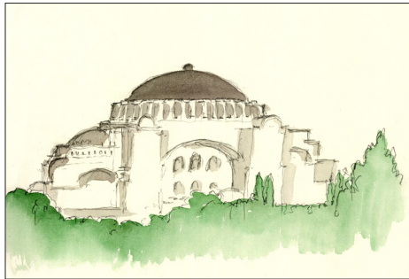
Hagia Sophia watercolor by Calatrava

On September 11, 2001, the thousands who senselessly perished in the terrorist attacks of that day were only the first and most grievous losses to our Nation. In the confused and stormy dark days that followed, even as we all gained some small measure of comfort